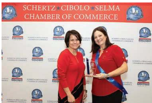
MEMBERS CHOICE AWARD MadWomen Marketing