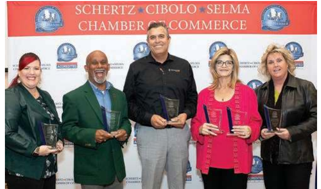
SPIRIT AWARD EPIC Mentor Board