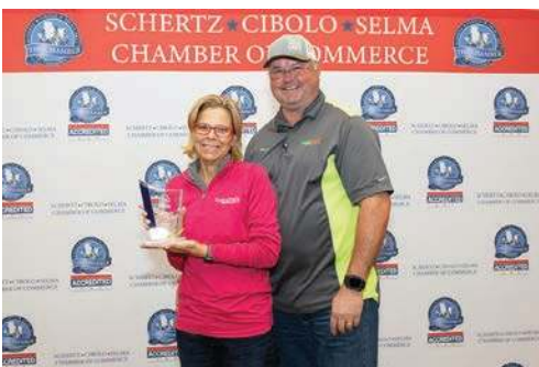
SMALL BUSINESS OF THE YEAR Tropical Smoothie Cafe