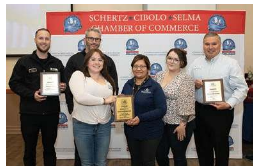
MIXER OF THE YEAR Santikos Entertainment Northeast Lakeview College | Living Spaces (Cibolo)